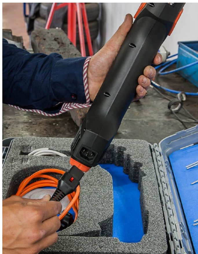
Unique application of IEC Lock plug with electrical hand tool