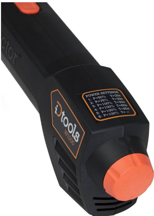
Single-control settings for operating power and switch-off time