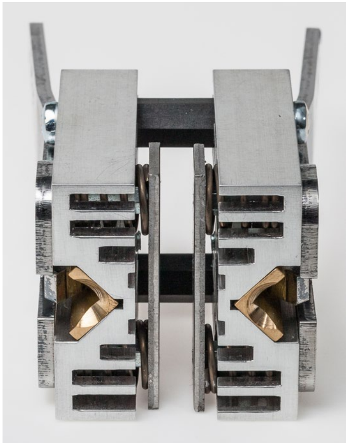
Unique clamping mechanism to allow easy exchange of coils and maintenance of a robust connection

All patented items are registered under number: EP 131665946.2